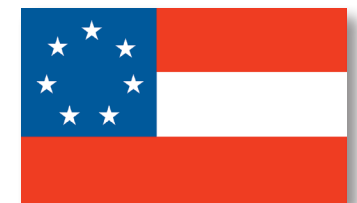
Confederate Stars & Bars Flag 1861