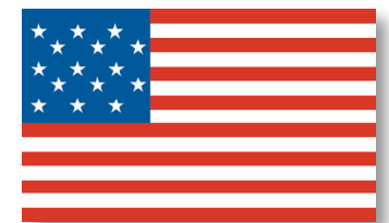
American Flag 1803-1861