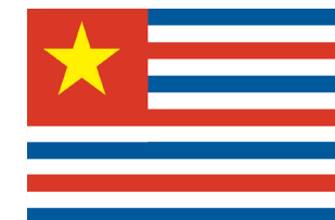
Independent Louisiana Flag 1861