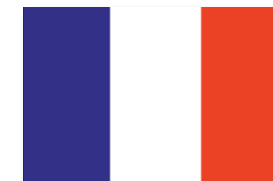
French Flag 1800-1803