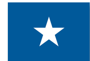
West Florida Republic Flag 1810