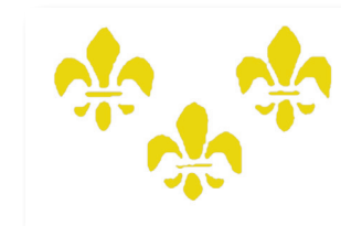
French Flag of La Salle 1682